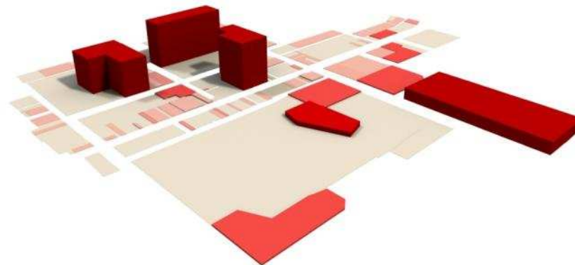
Coburg Initiative: Energy use baseline